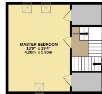
LOFT/SECOND FLOOR 400 sq.ft. (37.2 sq.m.) approx.