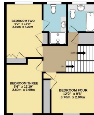
1ST FLOOR 522 sq.ft. (48.5 sq.m.) approx.