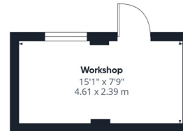
Floor 0 Building 3